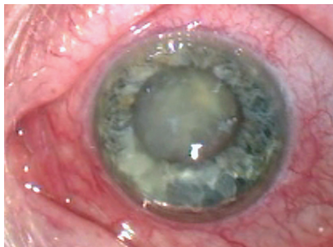
Fig. 2B: Left eye with advanced keratoconus and a mature cataract

Options which were available to us at this stage for her left eye were: