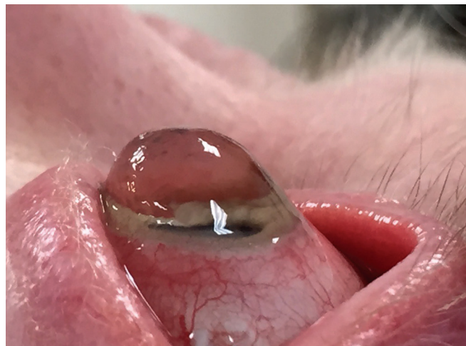
Fig. 2A: Profile of the left eye with advanced keratoconus