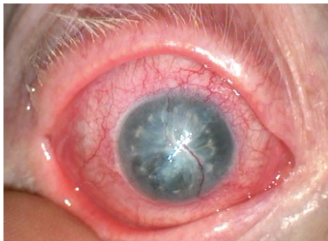
Fig. 1: Right eye with a sealed perforation of the cornea

On the day of assessment, after a successful general anesthesia, the examination under the surgical microscope revealed an old perforated right cornea with iris plugging. No anterior chamber or inflammation was present (Fig. 1). Examination also revealed very advanced keratoconus in the left eye (Fig. 2A) with severe thinning of cornea and Descemet's breaks. The left eye also had a dense white cataract (Fig. 2B). B-scan ultrasonography on the table showed no evidence of retinal detachment. The left eye felt softer on digital palpation as an indicator of intraocular pressure assessment. Keratometry on the left eye was attempted with a hand held keratometer on the operating table, but due to the extreme steepness of the cornea, keratometric readings could not be obtained. Therefore an estimated average K reading of 55.00 Diopter was used for the intraocular lens (IOL) calculation. A manual A-scan ultrasound biometry recorded an axial length of 24 mm and it estimated an IOL power of 0 Diopters.